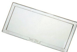
Magnifying Diopter Lens