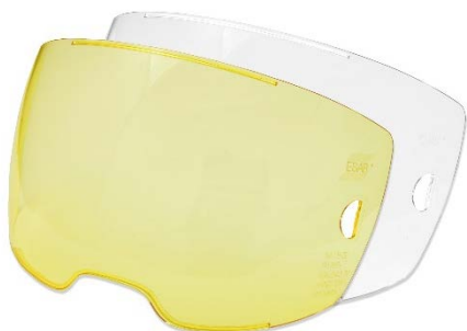
HD Front Cover Lens