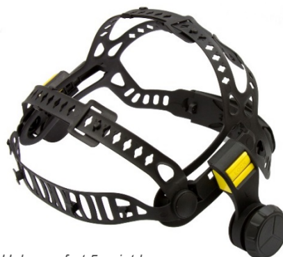
Halo comfort 5 point harness (Front view)