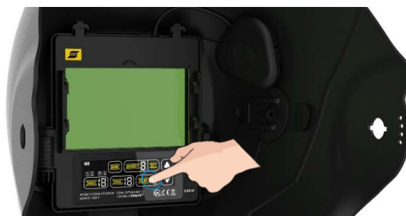
High optical class ADF, with colour touch screen interface